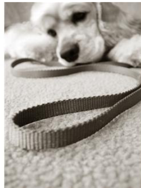
Leashes prevent jumping

In positive reinforcement training, we teach, acknowledge, and reward good behavior. But what about the bad behavior dog owners face daily from their best friend? Unwanted behavior should be prevented, ignored or redirected. That's a simple answer but incorporating the answer in every day life is a little more complicated. In this issue I will discuss the prevention portion of this strategy.